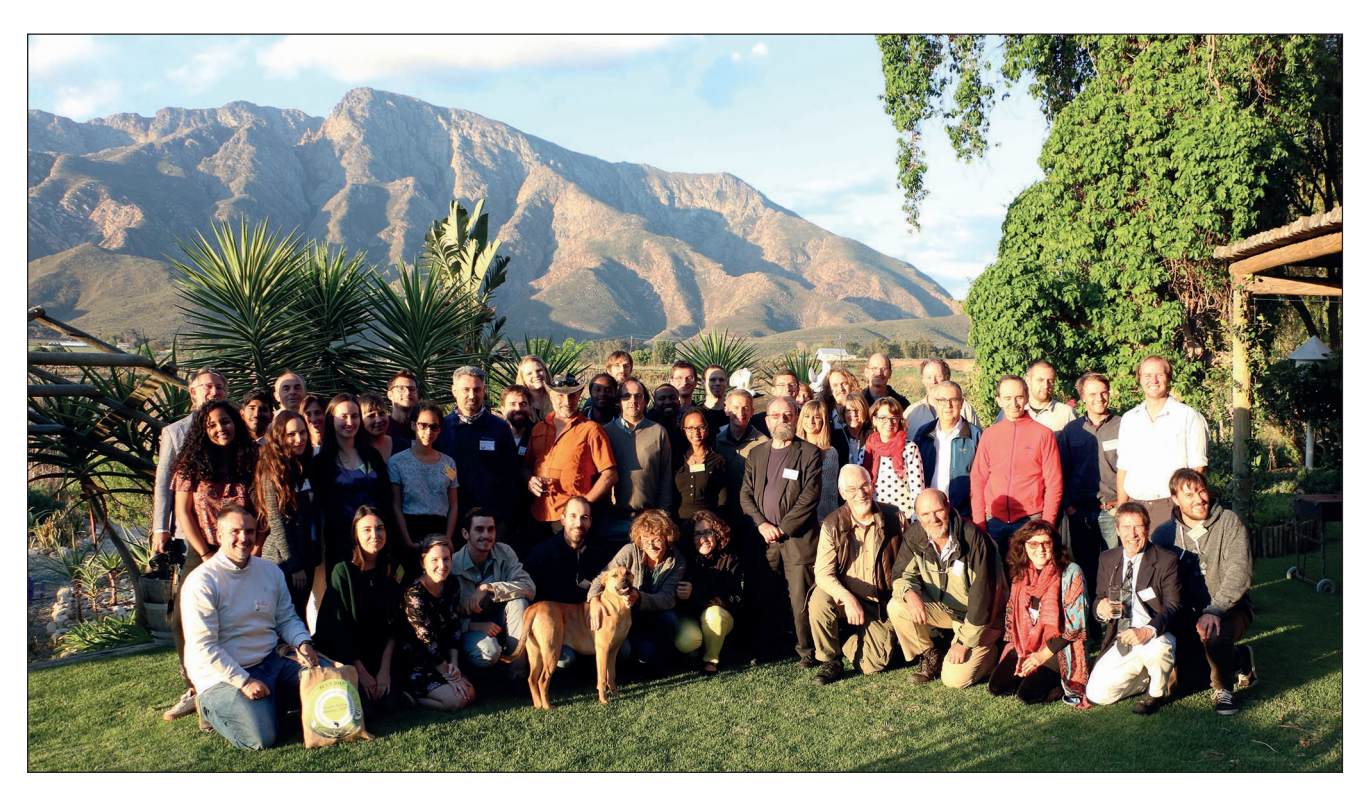
Fig. 3. Delegates at the ICCI 2017 during the conference dinner in Nuy Valley.

the time of track formation. The palaeosurface records both small-to-medium sized theropods that walked over ripple marks in firmer moist sand, and a larger theropod that waded across the waterlogged sand.