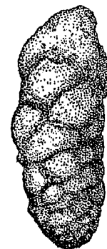
Fig. 1. Paratype specimen of " Gaudryina " cuvierensis Holbourn & Kaminski, 1995; sample 263-22-3, 117–121 cm.; x 30

Stratigraphic distribution: Lower Cretaceous (probably Hau-