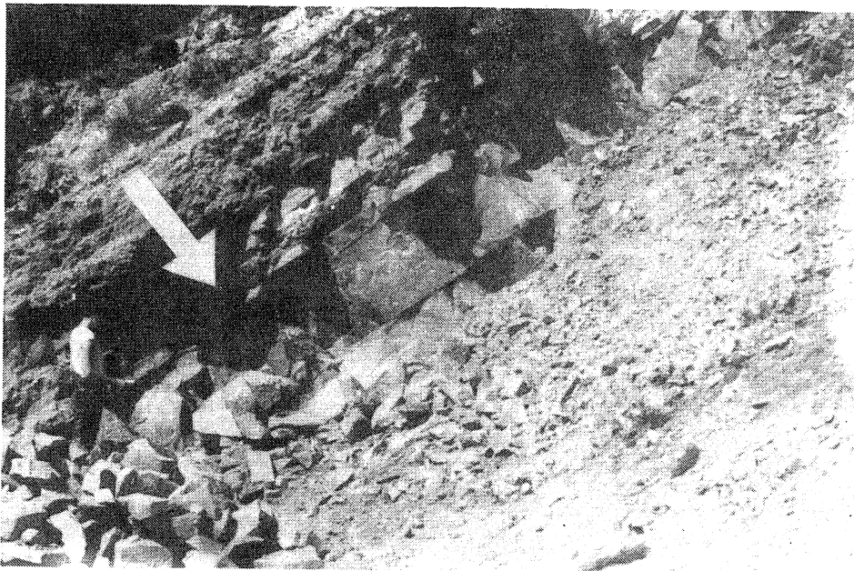
Fig. 2. Photo of the outcrop studied, showing location of sampled deposits (arrow)

The palynological samples have been collected in the quarry in Niestachów near Kielce (Fig. 1), situated at the eastern slope of the Otrocz Hill. They represent clayey mudstones and shales in the Niestachów Sandstone Formation. Five samples were processed, using standard methods. Four of these yielded palynomorphs. Eighteen slides were examined. The material is stored in the Institute of Geological Sciences, Polish Academy of Sciences in Warszawa.